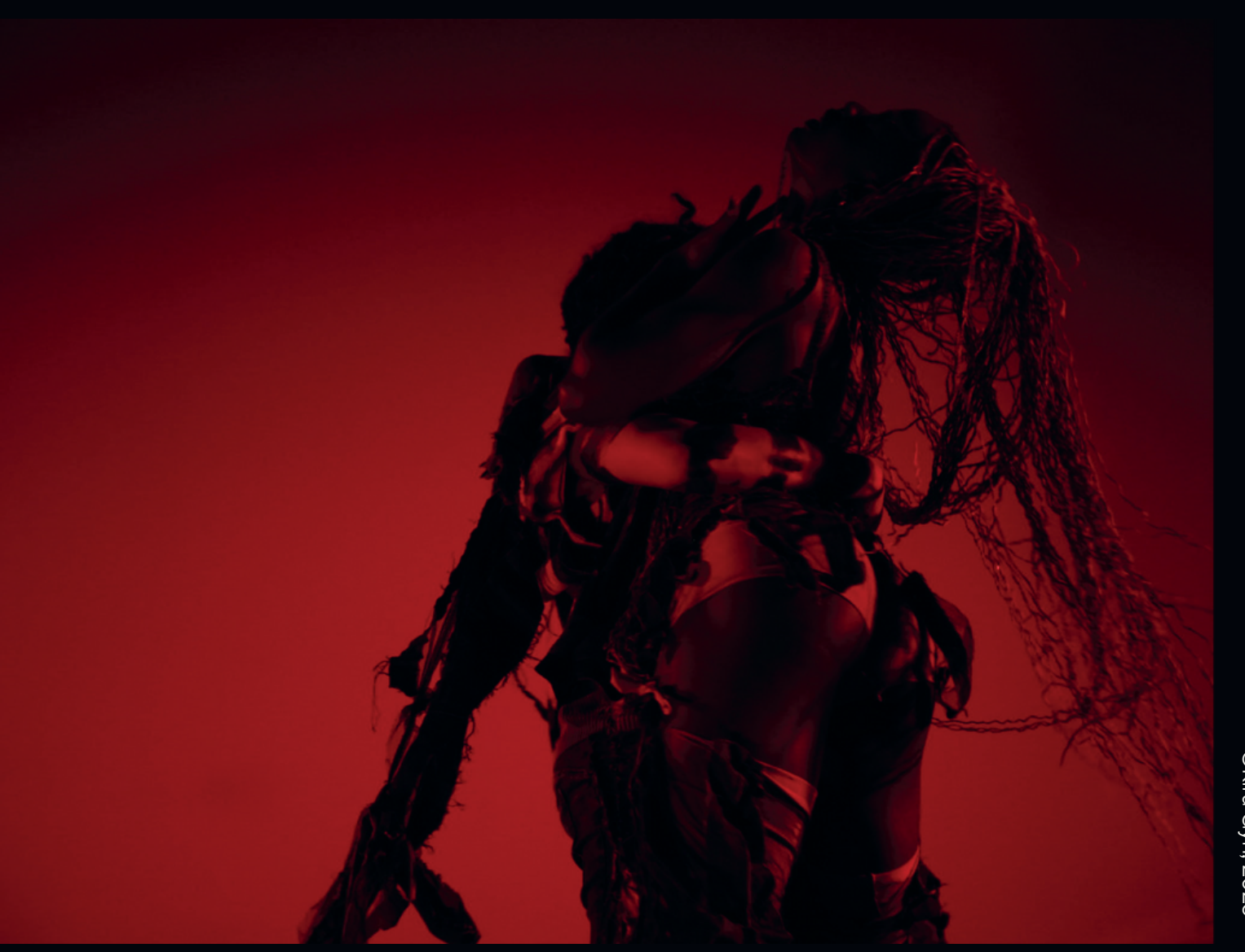
18" | 2023